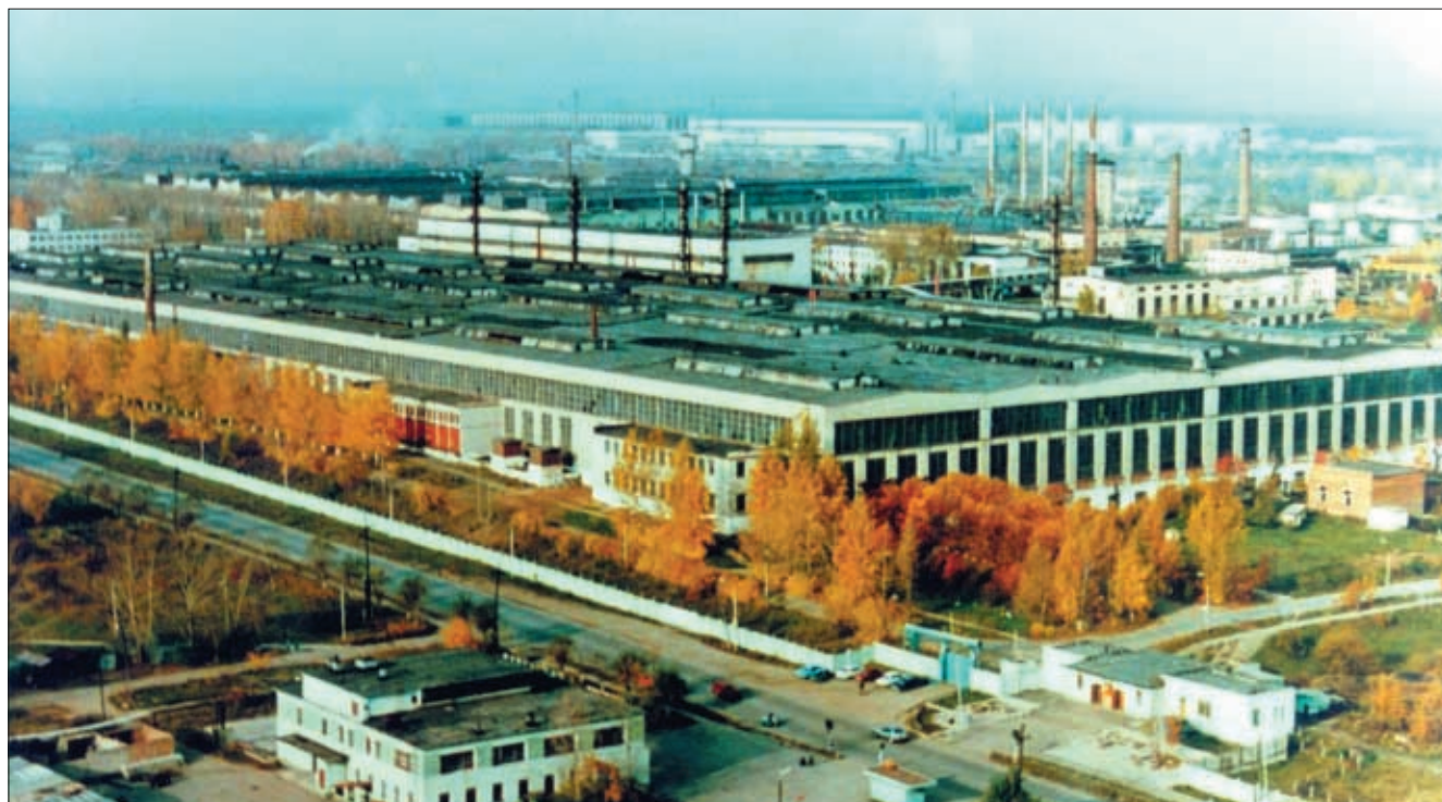
An overview of vsmPO's facilities

There are only few materials that can match titanium's performance in offshore operating conditions and it is considered the material of choice for many applications such as offshore pipelines, heat exchangers, fire water systems and ancillary equipment. Often the underwater system in the upper parts of the floating systems incorporates in between 50 and 100 tonnes of titanium alloys. Conoco for example used a high-strength titanium for the