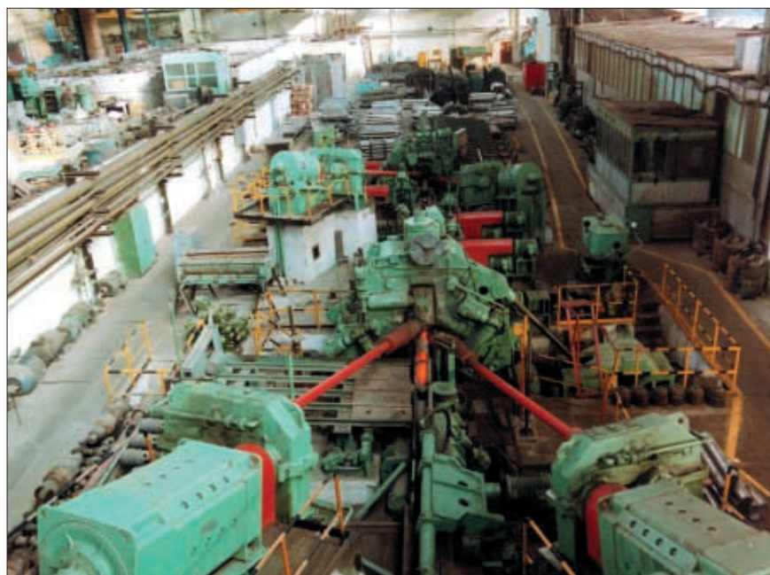
VSMPO is expanding its presence on the world market.